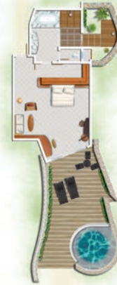
Beachfront Suite with pool