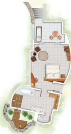
Tropical Junior Suite