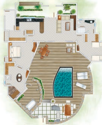
2-Bedroom Pool Villa