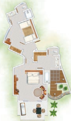
2-Bedroom Family Suite